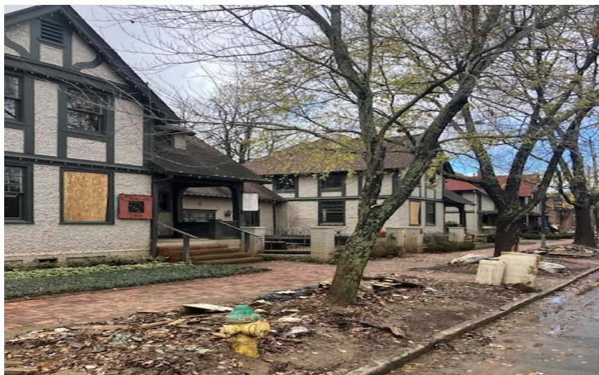
Figure 2. Biltmore Village

in the dark evening of the storm, uprooting trees and bucketing sand and soil into the reservoir. In this terrible whirl, the lake's bottom layers of sediment and clay were churned up to the surface, and the once-crystal blue lake turned chocolate brown. The raging water destroyed the treatment plant's distribution lines and washed-out roads leading to the plant. Just like that, the city lost its chief water supply and the means to reach the lake and assess the damage. Amidst the wreckage the dam held firm, most likely because of a massive auxiliary concrete spillway which was just completed in 2021. The spillway's first of eight massive concrete gates performed as designed: to break open in the event of a 1000-year flood. Had the spillway failed and the dam burst, the gates of Hell would have opened. A spokesperson for the Asheville Water Resources Department declared to the press, "If that North Fork dam had failed and unleashed six billion gallons of water, it would've meant complete annihilation of everything and every person between Black Mountain and Biltmore Village."