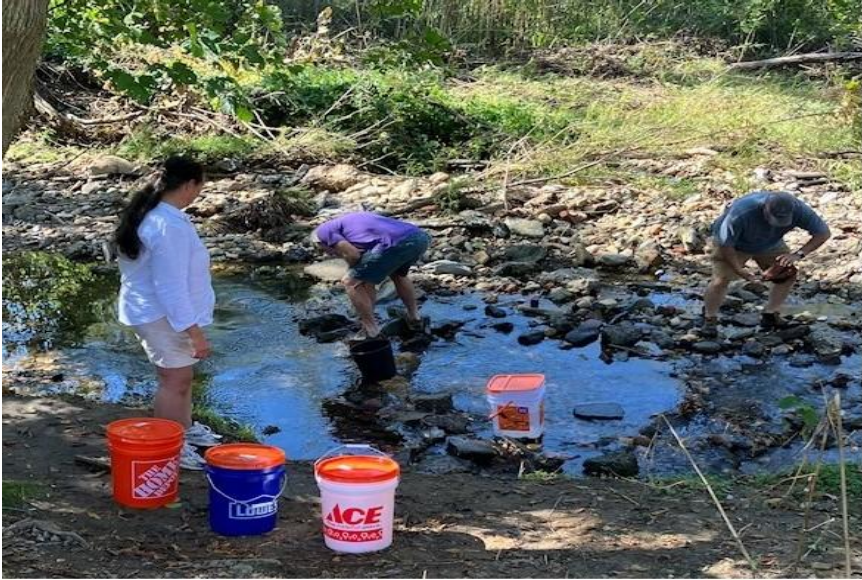
Figure 4. Neighbors collecting flushing water at Reed Creek in Asheville's Montford neighborhood

distributed thousands of gallons of water to the needy in 400 totes. Just as extraordinary were the appearances of portable emergency water filtration units, called AquaBlocks, specifically designed to filter creek water for consumption. In a week, the charities Planet Water and Americares set up a series of metal-clad AquaBlocks in both Asheville and Swannanoa to release 17,000 gallons of healthy water daily (Figure 5).