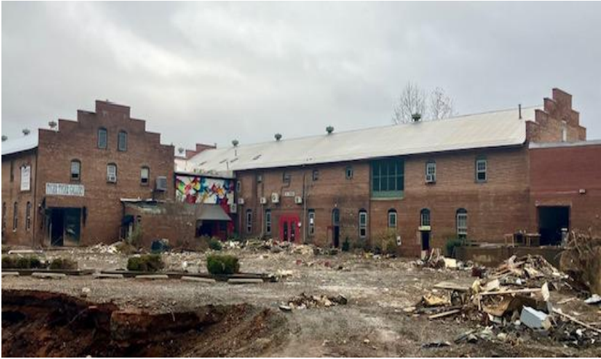
Figure 1. After the flood: River Arts District

withstood the 1916 storm. Over time most were vacated and shuttered and by the 1980s, enterprising local artists and gallery owners began moving in, taking advantage of cheap and adaptable spaces facing the French Broad. In organic fashion the River Arts District steadily took shape to represent hundreds of artists and prosper as a tourist hotspot. As in the Great Flood, the district's durable industrial buildings withstood Helene, but river water and toxic mud engulfed the precious interior art spaces. One estimate has it that the flooding damaged some 80 percent of the galleries and studios in the district (Figure 1).