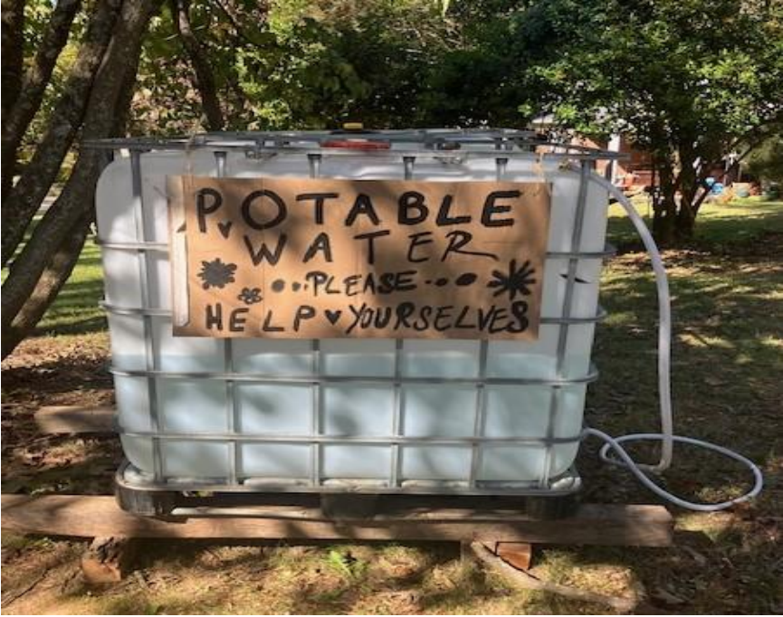
Figure 5. Drinking water to the rescue

On November 18, 2024, nearly two months after Helene, came reason for cheer. On that day, Asheville residents once again drew potable water from their taps. The city lifted the boil water notice and pushed over 20 million gallons of water through the treatment plant. The destroyed transmission lines were back in action and the obdurate turbidity brought to heel. The upended waterworks were now essentially under control and back to normal.